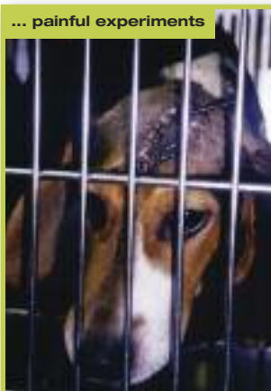
... painful experiments