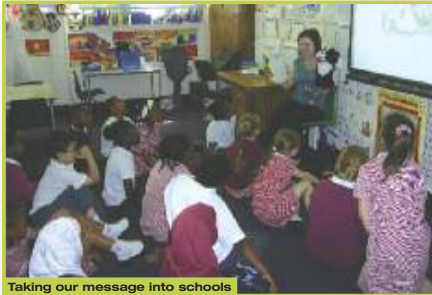
Taking our message into schools