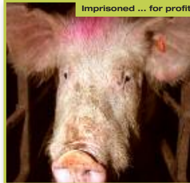
Imprisoned ... for profit

coverage of our films, exposing the treatment of chickens, sheep, cows and goats, as well as a front-page report in the Independent newspaper, showing the conditions in which factory-farmed pigs are kept. Our campaign has also stopped horses being sold for meat at Ascot.