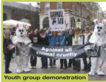
Youth group demonstration