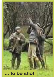
... to be shot