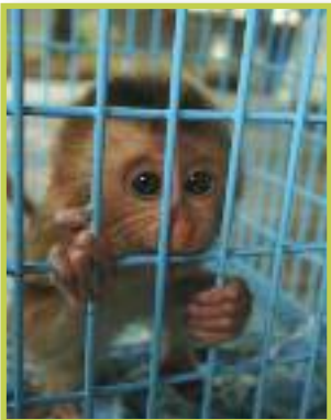
... and used for misleading, unnecessary and ...

non-animal research techniques available. Animal Aid opposes all animal experiments, and played a central role in the successful campaign to prevent the building of a massive new monkey research laboratory in Cambridge. Again alongside other groups, we have worked hard to get the best possible result for animals from the recent update of European law on vivisection.